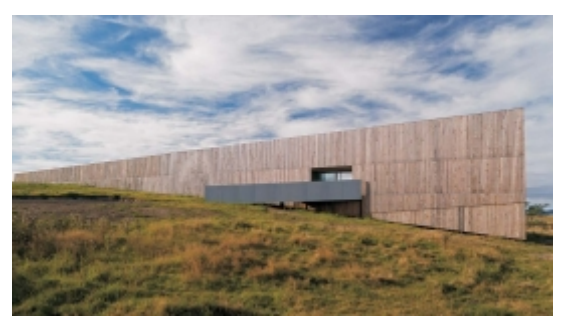
Sandcastles - Now at new time Wed 10pm on 7Two

Once again, the Institute is working with the team behind Sandcastles to present some of the best architectural work in this country to a wide audience. This week the show features Marion Bay House by 1+2 Architecture.