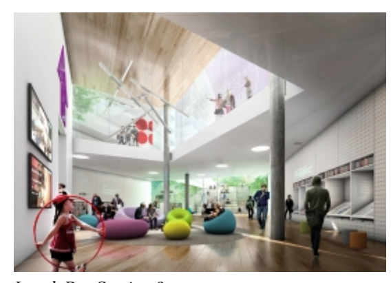
Lunch Box Session 3 Diamonds and Disasters