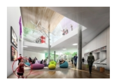
Lunchbox Session 3 - Diamonds and Disasters