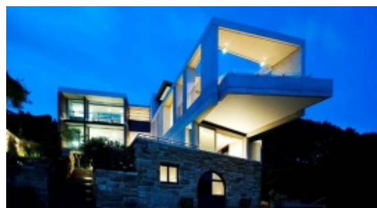
Sandcastles Season 3

Join us for the night-of-nights of Australian