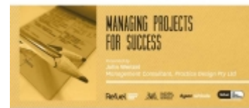
NNS5 - Managing Projects for Success

This seminar will develop project planning and project management skills for architects to help them become 'project leaders' and contribute to the success of their team, project delivery and sustainability of their practice.