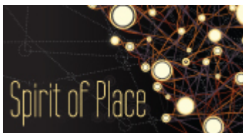
Spirit of Place - only three weeks to go!

The full program is now available on the website, along with ticket prices and the registration link. To book now or for more information visit the Spirit of Place website .