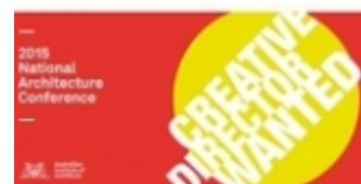
2015 National Architecture Conference – Call for Creative Director

The Institute is now seeking expressions of interest for the role of the Creative Director for the 2015 National Architecture Conference.