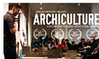
Archiculture Film Showing on Gold Coast