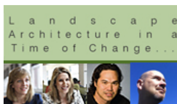
Landscape in a time of change - AILA