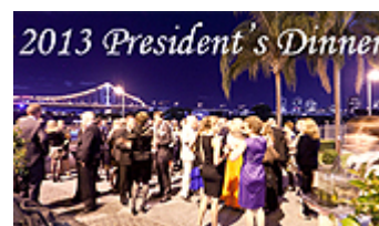
2013 President's Dinner