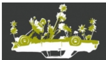
PARK(ing) Day Adelaide

Hub Adelaide officially opens for co-working. Anyone from any industry & background can be connected to an inspiring community of professionals, social entrepreneurs, freelancers and people just