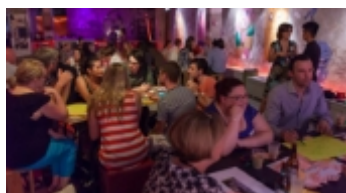
Hub Adelaide Opening