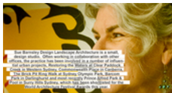
Speaker Series 2013