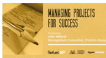
NSS5: Managing Projects for Success

The inaugural Queensland regional conference looks at the unique opportunities commonly available to architects practising