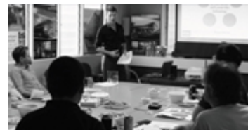
Fee Proposal Workshop