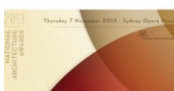
National Architecture Awards 2013

Do not miss this very special event! To celebrate the 40th anniversary of Sydney Opera House, this symposium brings together Danish and Australian architects and designers to