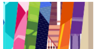
BIM Adoption and Value Survey

Autodesk has announced its participation in McGraw-Hill's BIM Adoption and Value Survey for Australia and New Zealand. This survey takes a comprehensive look at BIM adoption and usage by architects, engineers, planners and contractors.