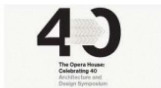
Architecture and Design Symposium