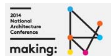
Making 2014 - start making plans!

Join us for the night-of-nights of Australian architecture, celebrating the best and boldest designs of the year in Australia's most celebrated work of