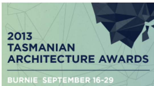
2013 Architecture Awards, Burnie Exhibition