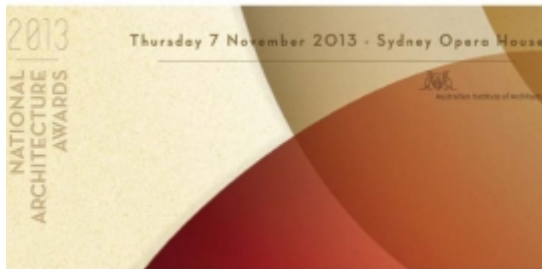
National Architecture Awards 2013