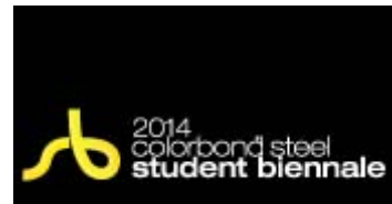
Colorbond Steel Student Biennale

Stage One entries are now open for the Biennale, now in its 25th year.