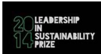
Leadership in Sustainability Prize

Entries are now open for the 2014 Leadership in Sustainability Prize.