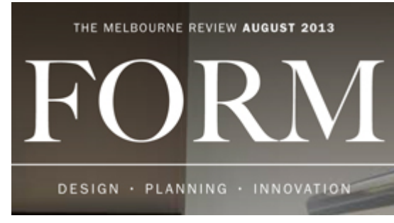
FORM Magazine (The Melbourne Review): Vic Awards Edition