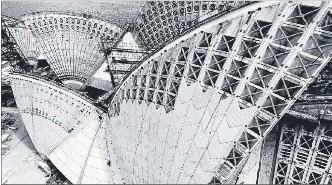
One of the spectacular images of the Sydney Opera House under construction that will be on display this week.