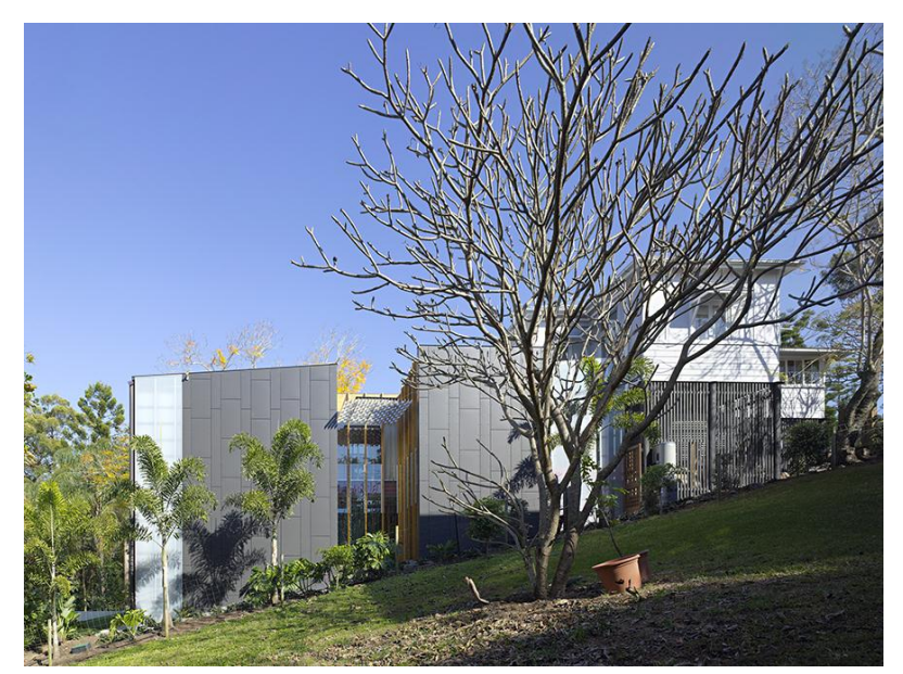
Taringa House by Loucas Zahos Architects.

An original worker's cottage, Taringa House has been expanded with a juxtaposed new addition by Loucas Zahos Architects to accommodate family activity while retaining the traditional frontage, to allow the home to remain firmly settled in the existing street fabric.