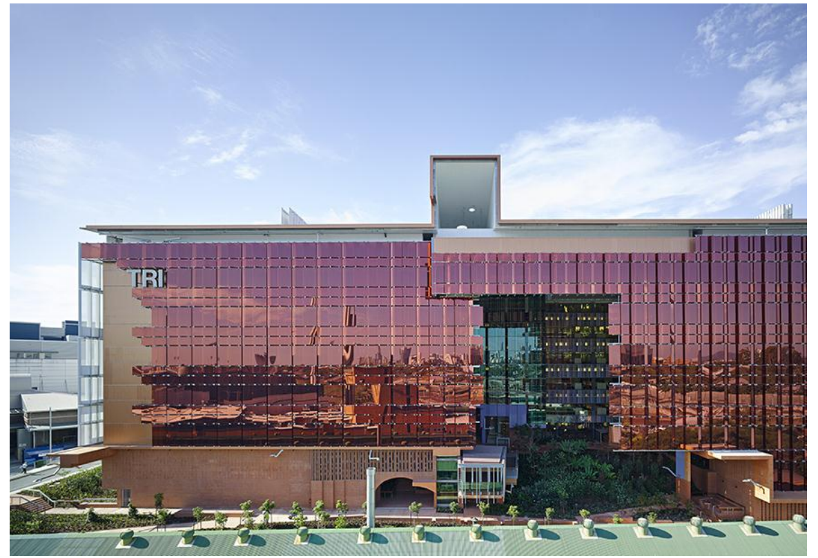
Translational Research Institute by Wilson Architects + Donovan Hill (Architects in Association).

spaces across a range of scales that redefine not only the cramped campus in which it is located, but also the laboratory building typology itself,' said the jury.