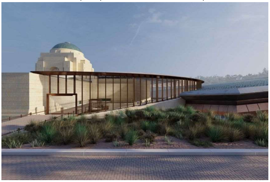
The Australian War Memorial is proposing the demolition of the current Anzac Hall, to make way for this new one.