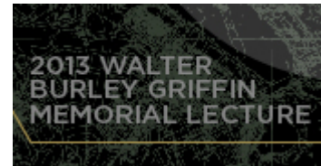
Walter Burley Griffin Memorial Lecture