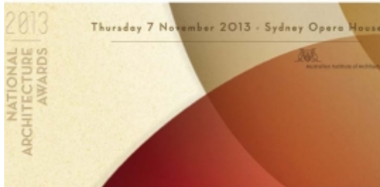
National Architecture Awards 2013