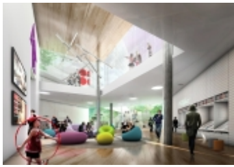
Lunchbox Session 3 - Diamonds and Disasters