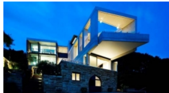
Sandcastles Season 3