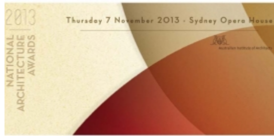
National Architecture Awards 2013