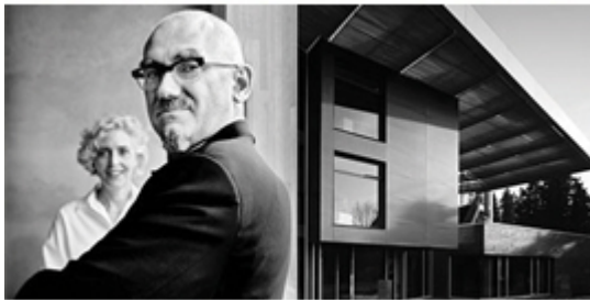
NAG Gold Medallist Lunch